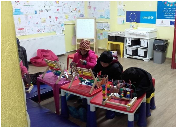
UNICEF/World Vision child friendly space in the RAP available 24/7, Sid (Serbia), ©UNHCR, 13 February 2016

8,229 (2,644 on 12/02; 2,613 on 13/02; 1,764 on 14/02 and 1,208 on 15/02) refugees departed to Croatia on ten trains. 395 were denied boarding by Croatian authorities and placed in the Sid RAP.