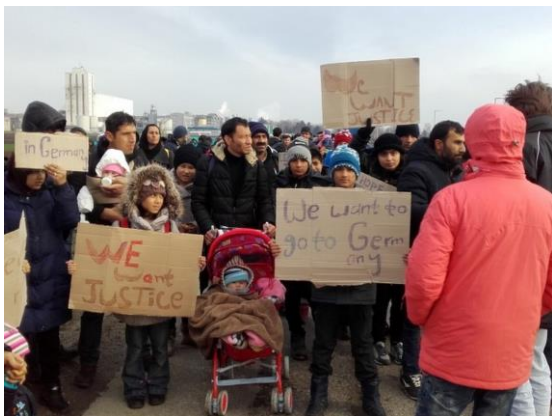
A group of about 200 refugees/migrants who tried to walk towards Croatia, Šid (Serbia), 21 February 2016

In 760 instances refugees and migrants were denied boarding by Croatian authorities of two trains that departed during the reporting period. They were accommodated in the Sid and Principovac RAPs.