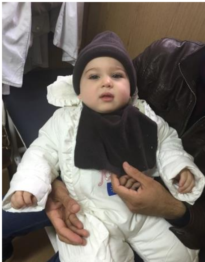
A refugee boy in a new ECHO donated snowsuit, Šid (Serbia), ©UNHCR, 23 February 2016

At Sid train station, UNHCR/HCIT distributed 150 UNHCR blankets, 700 WFP HEB, 1,384 water bottles, 77 winter jackets, 101 boots, and 15 UNHCR bags. IDC/Sid Health Centre and WAHA treated 64. Approximately 750 refugees were hosted at night in the RAP.