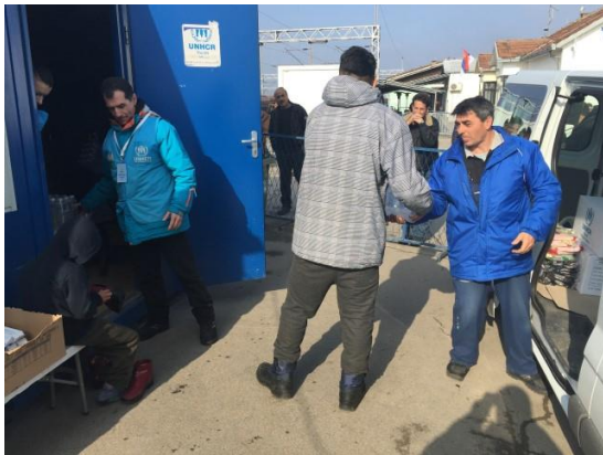
Distribution of non-food items at the train station, Šid (Serbia), 9 March 2016

Approximately 470 stranded refugees remained in the Sid RAP. No train arrived from Croatia to Sid train station, consequently there were no departures.