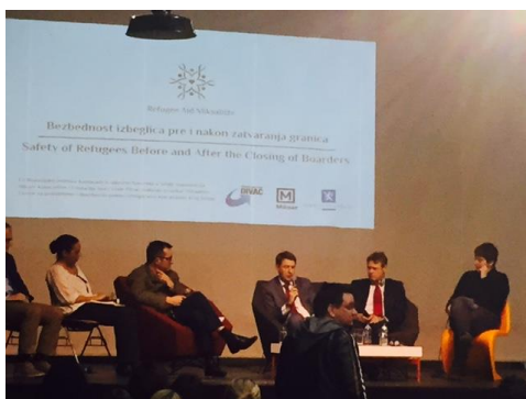
"Safety of Refugees Before and After the Closing of Borders" event, Belgrade (Serbia), 15 March 2016

UNHCR partners in Belgrade assisted more than 120 refugees and asylum seekers. They were mainly from Morocco, Algeria or Afghanistan, with a few from Syria and Iraq. Some 50 were observed in the city centre at night.