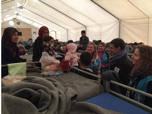
Answering questions at the Refugee Aid Point in Šid, (Serbia), 17 March 2016

UNHCR Representative visited Sid and Adasevci RAPs, where he met with refugees, the SCRM, HCIT as well as with representatives from the Bureau of Population, Refugees and Migration of U.S. Department of State, CRS and Balkan Center for Migration.