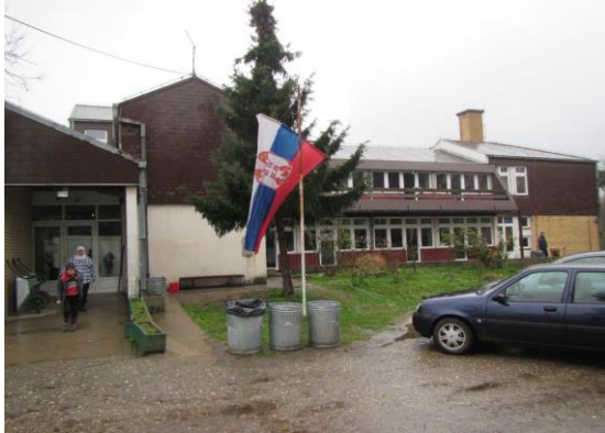
Entrance of Principovac RAP. Šid (Serbia) ©UNHCR, 23 March 2016

Over 700 refugees from Syria, Afghanistan and Iraq were hosted the three sites in the West. 224 individuals were accommodated in Sid RAP, some 300 in Adasevci RAP and other 184 individuals in Principovac RAP. SCRM and UNHCR continued the verification of the population.