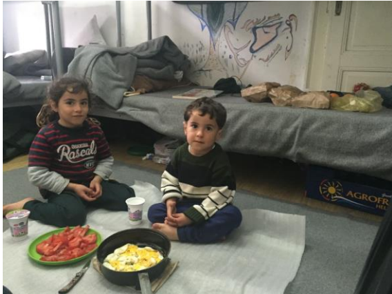
Children having breakfast in Sid RAP, Sid (Serbia) ©UNHCR, 28 March 2016

Approximately 500 refugees were hosted in the three Refugee Aid Points (RAP) in the West: