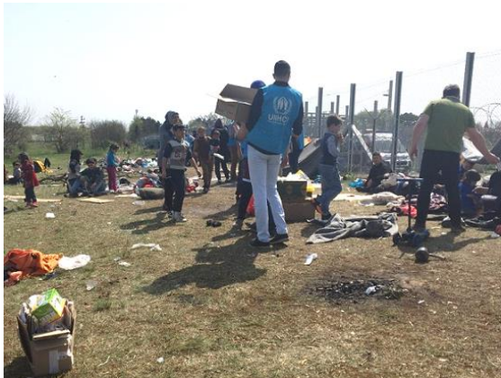
Aid distribution by UNHCR/HCIT Serbia and UNHCR Hungary at the Kelebija border crossing on the Serbian-Hungarian border, Kelebija (Serbia), 7 April 2016