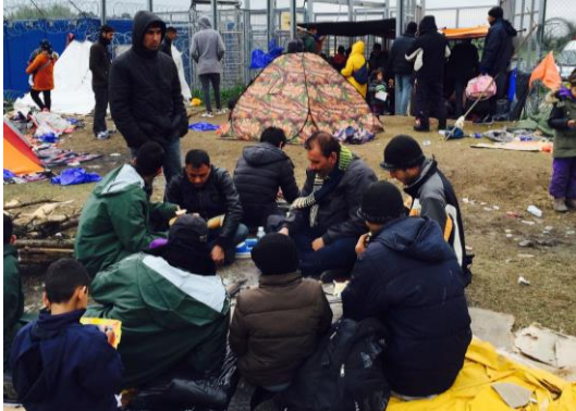
Asylum seekers waiting outside the Hungarian “transit zone” at border crossing Kelebija, Kelebija (Serbia), 10 April 2016

Approximately 60 asylum-seekers were admitted into Hungarian asylum procedures close to Horgos I and Kalabija border-crossings every day. Some 50-100 asylum, including women and children, waited outside the two “transit zones” in the open land at any one time. They arrived from the Refugees Aid Points (RAP) in the West and from Belgrade.