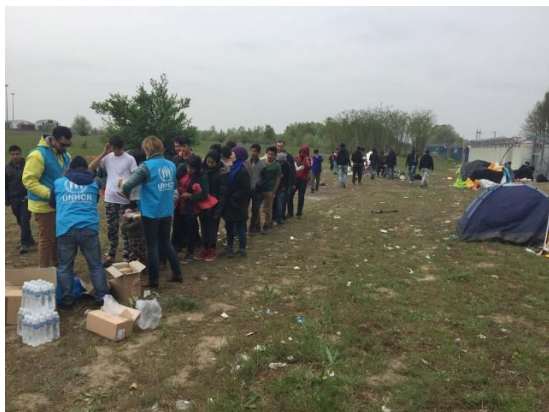
Distribution of aid at the Horgoš border crossing on the Serbian-Hungarian border, Horgoš (Serbia), ©UNHCR, 11 April 2016

Over 90 asylum seekers, including women and 22 children, waited in improvised tents outside the two "transit zones" in Kelebije and Horgos. Around 30 asylum seekers were admitted into each border crossing.