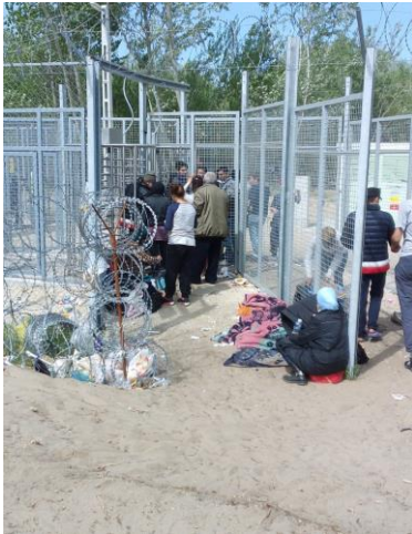
Asylum seekers waiting to enter into Horgos I “transit zone”, Horgos (Serbia) ©HCIT, 13 April 2016

Around 130 asylum seekers, including many women and children, waited outside the two “transit zones” near Kelebije and Horgos I border-crossings. They arrived from transit facilities in the West or entered Serbia irregularly from FYR Macedonia or Bulgaria and had reached the North through Belgrade. Some 30 asylum seekers were admitted into each “transit zone”.