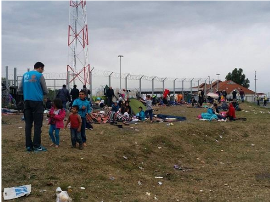
The number of asylum seekers arriving to the Serbian-Hungarian border is increasing, Horgoš (Serbia), ©HCIT, 18 April 2016

Only 60 refugees remained accommodated in the West: 22 in Adasevci and 38 in Sid (including some 25 AVR candidates, who still await transfer to more suitable accommodation) while Principovac transit site / Refugee Aid Point (RAP) became empty again when its last five residents departed.