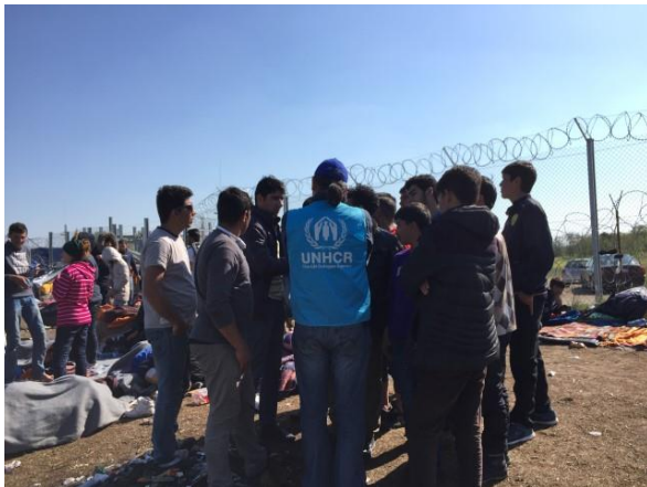
UNHCR team monitoring and assisting asylum seekers on the Serbian–Hungarian border, Horgoš (Serbia), ©UNHCR, 21 April 2016

Approximately 330 asylum seekers, including 17 unaccompanied and separated children, waited outside the two “transit zones” in Kelebija and Horgos I border-crossings or near Subotica. They had arrived from Sid and Presevo but many were