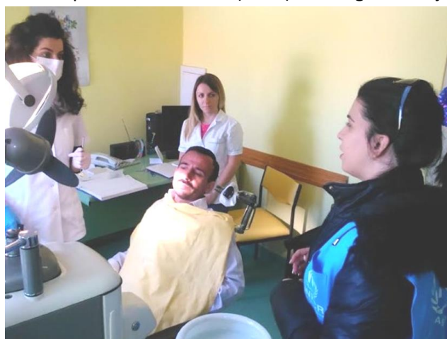
A Syrian refugee from Šid RAP was provided with dental care in the Health Centre in Šid, Photo©HCIT, 21 April 2016