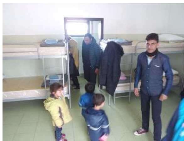
Two Afghan families preparing to stay in the Subotica RAP, Subotica (Serbia)