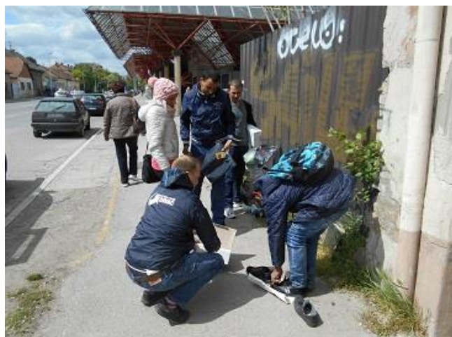
Divac Foundation distributing shoes and other NFIs in Belgrade, Photo@Divac, April 2016