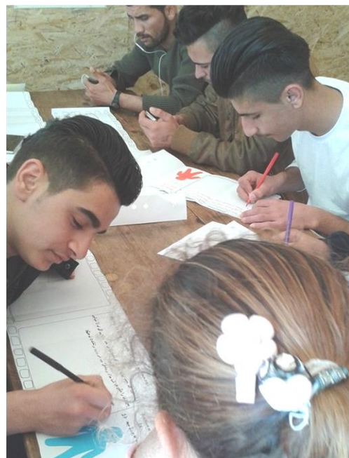
Save the Children organized lessons on movie design (screenplay) for the youth in Preševo centre,