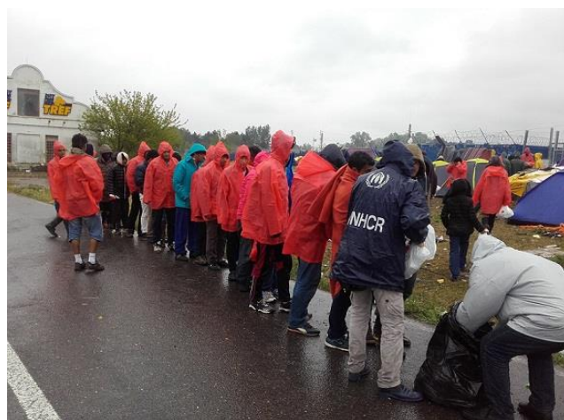
Food distribution at Kelebija border crossing on Serbia-Hungary border, Photo@UNHCR, 25 April 2016