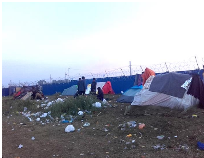
Asylum seekers at Kelebija border crossing waiting to be admitted into Hungarian "transit zone", Photo©UNHCR, 25 April 2016