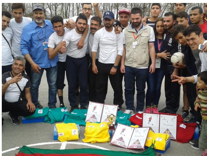
The winning team at the football tournament, Preševo Reception Centre, Photo@UNHCR, 2 April 2016

stakeholders in order to provide necessary support to the work with refugees, especially when it comes to protecting the most vulnerable (victims of human trafficking and other forms of GBV).