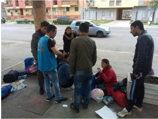
Counselling of refugees/migrants at the main bus station in Subotica, Subotica (Serbia), @HCIT, 24 May 2016

Over 500 asylum seekers, mainly women and children, were present at the end of the reporting period outside the “transit zones” at Kelebjica and Horgos I border crossings.