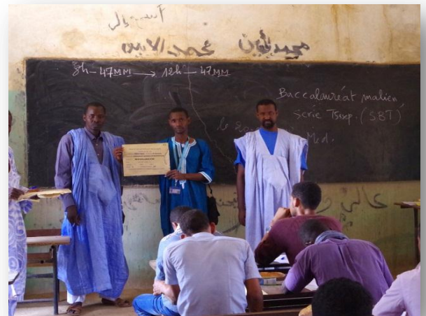
Baccalaureate exam session in Bassikounou.