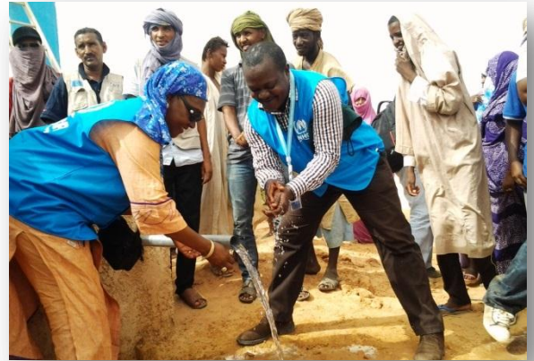
Water point in Mberra Camp.