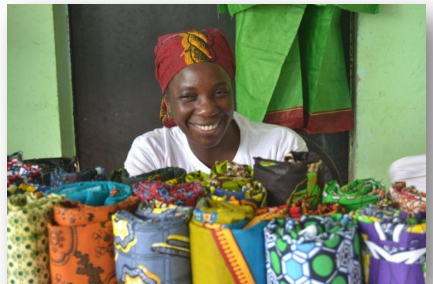
Exhibition at the World Refugee Day in Nouakchott