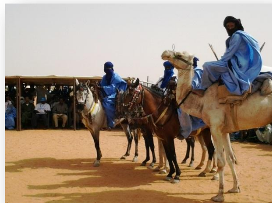
Celebrations of World Refugee Day in Mberra Camp