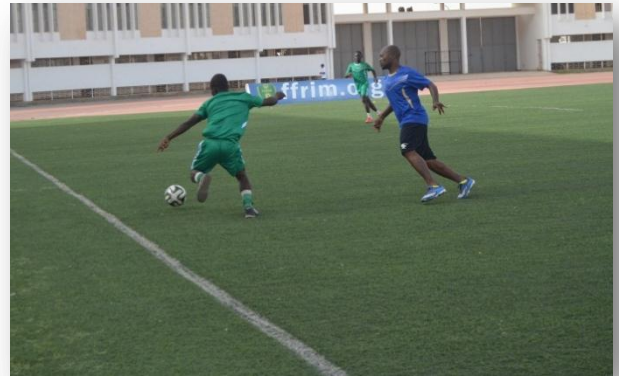
Football match between urban refugees and Mauritanian nationals in Nouakchott