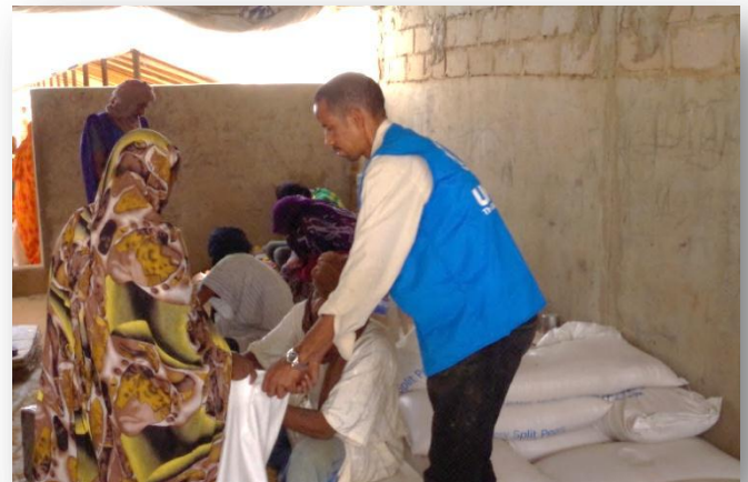
June food distribution in Mberra Camp.