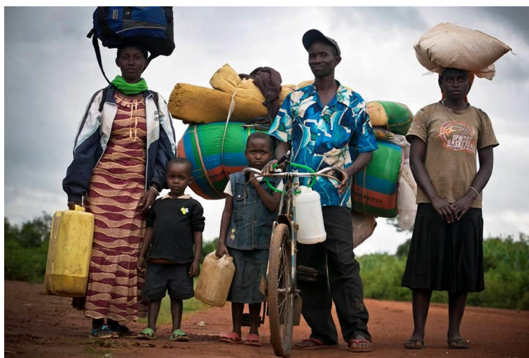
New arrivals in Bugesera reception centre, eastern Rwanda.