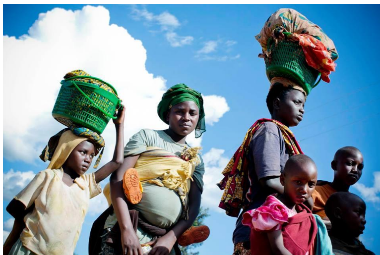
Burundians arrive in Bugesera transit centre in eastern Rwanda.