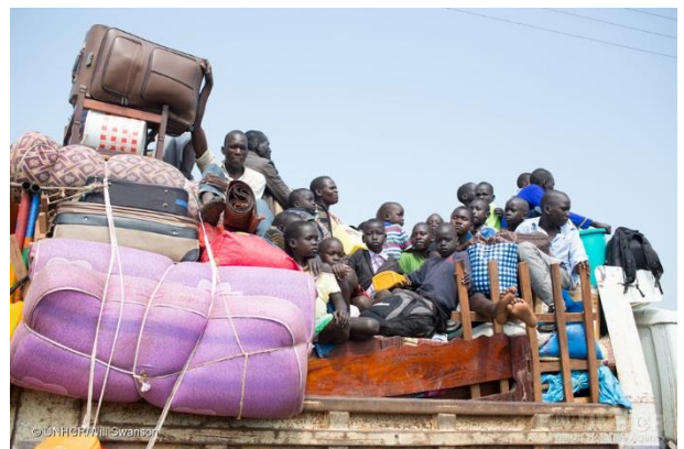
South Sudanese refugees, many of them young boys, arrive at the collection centre in Elegu, Uganda.