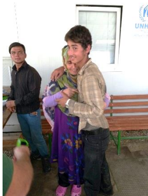
13 y.o. Afghan boy reunited with his family, Presevo (Serbia), 31 July 2016

Presevo Reception Centre (RC) continued to host an average of 133 refugees/migrants (from Afghanistan, Syria, Iraq, Bangladesh, etc.), arrivals from FYRo Macedonia and other reception facilities.