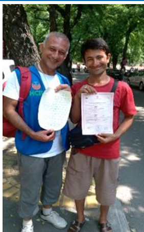
Afghan asylum-seeker obtained a birth certificate for his baby born in Subotica hospital, Subotica (Serbia), @HCIT, 10 Aug 2016

Some 1,113 asylum seekers were present at the end of the reporting period at the border with Hungary. Of these 430 were in Horgos I and 153 in Kelebija - predominantly women and children (63%) from Afghanistan and Syria - waiting for long periods of time in difficult conditions, as the weather turned colder with cold showers on 10 August.