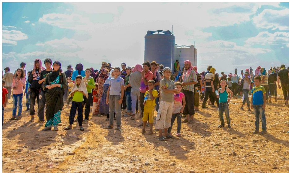
Syrians at Rukban gather around two water towers close to the Jordanian berm where many are surviving in desperate conditions.

*This operational update covers activities for the month of July.