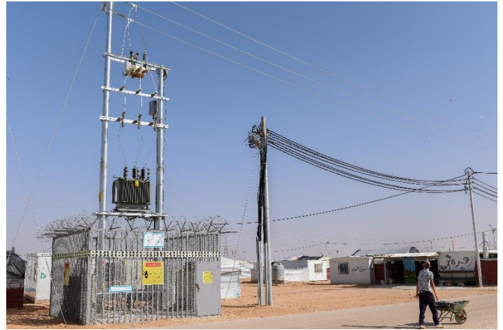
Before and after photos showing the progress made to the electrical network in Zaatari after the completion of the Czech Republic-funded project on 14 July.

A solar power plant, funded by the German development bank, KfW, is also being developed in Zaatari village which will provide a renewable source of electricity for the camp and the surrounding host community. The project is expected to become operational in 2017.