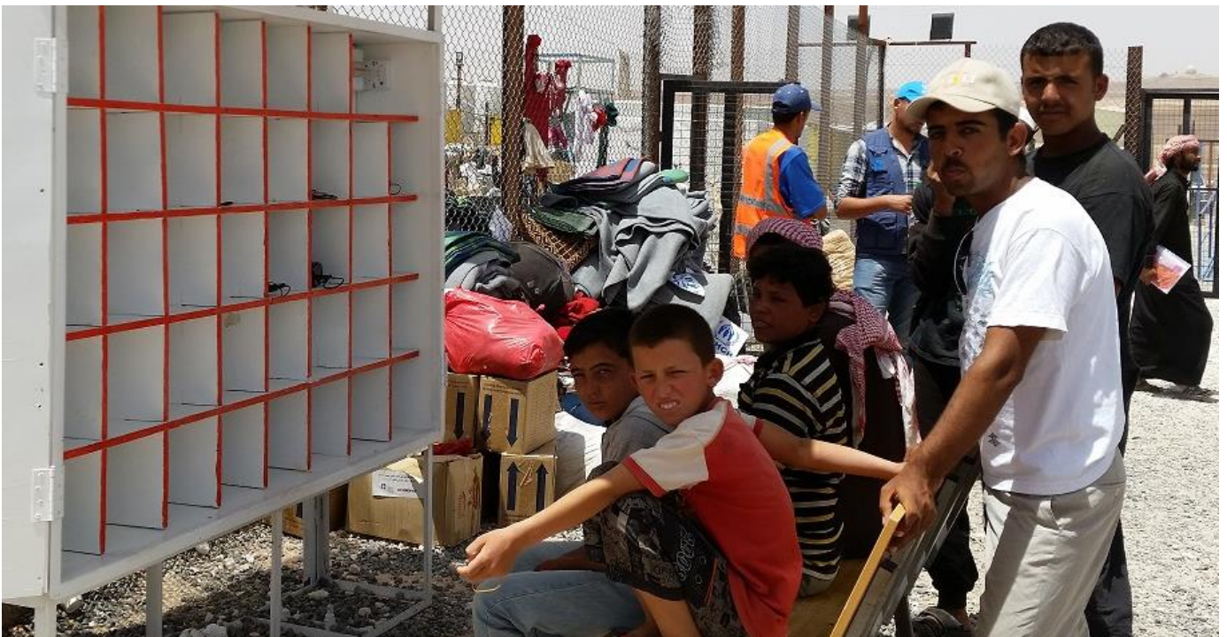
Syrian refugees making use of the new mobile charging stations at Azraq camp in May 2016, part of a series of initiatives undertaken through UNHCR's "Global Programme for Connectivity for Refugees".