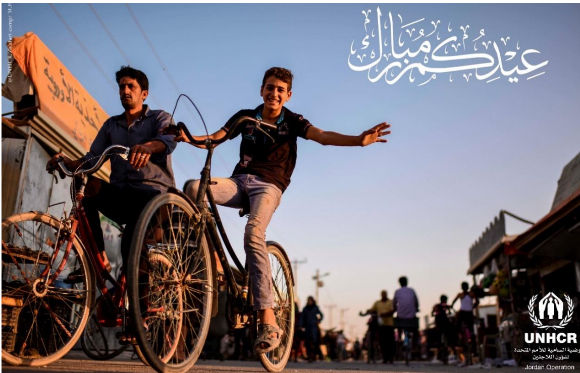
Eid Mubarak! Two Syrian refugees biking down the "Champs-Élysées" street in Zaatari camp.

In close cooperation with the Government, the World Food Programme (WFP), UNICEF, UNHCR and the International Organization for Migration (IOM) were able to proceed with a delivery of aid to both locations - Hadalat and Rukban - for the first time since 21 June between 2 - 4 August. The deliveries included 650 tonnes of food, including rice, lentils and dates, hygiene kits and jerry cans using cranes to deliver supplies to the Syrian side.