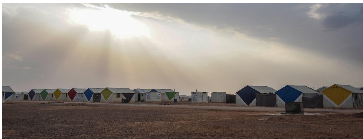
Dusk sets over Azraq refugee camp in Jordan's eastern desert.

Major donors of unrestricted and regional funds in 2016: United States of America (181 M) | Sweden (78 M) | Netherlands (46 M) | Norway (40 M) | Australia (31 M) | Priv Donors Spain (25 M) | Denmark (24 M) | Canada (16 M) | Switzerland (15 M) | France (14 M) | Germany (13 M) | Italy (10 M)