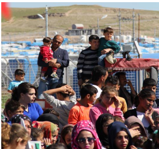
Celebration of International Women day in Kawergosk refugee camp, Erbil,

An Associate Resettlement Officer has joined the unit to support and take the role of the Officer in Charge for Resettlement Unit.