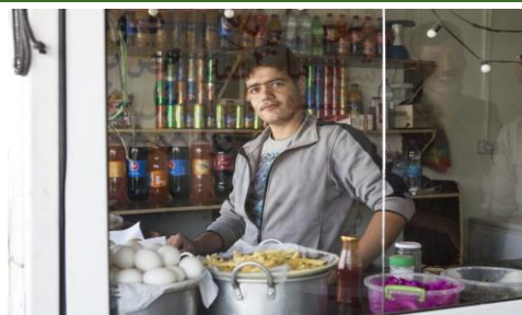
General views of stores on the Champs Elysees, in Zaatar refugee camp, Jordan, which has 3,000 shops throughout the camp.

3RP partners are working together with the private sector and national Governments to determine how best to create livelihood opportunities for women and men that fill gaps within labour markets and contribute to the establishment of new enterprises, rather than fostering competition for jobs and driving down wages.