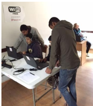
IT corner at Sid RAP, Sid (Serbia) 05 Oct 2016

The Refugee Aid Points in Sid, Adasevci and Principovac sheltered 1,882 refugees and migrants on 05 October. Most were from Afghanistan, followed by Syria and Pakistan, with the rest from Iraq, Iran, Bangladesh, Morocco or Algeria.