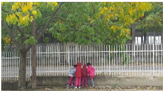
Refugee children playing, Presevo (Serbia), 06 Oct 2016

The Presevo Reception Centre (RC) accommodated some 700 refugees and migrants, most from Afghanistan (60%), Iraq (16%) or Syria (13%), with 11% from other countries. About half are children.