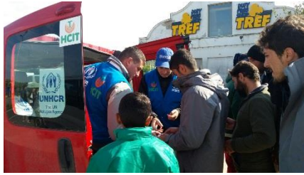
UNHCR/HCIT distributing NFIs at Kelebija, Kelebija (Serbia) @HCIT, 18 October 2016

The total number of asylum seekers in the North remained stable with some 390 counted on 19 October. This number includes 140 people sheltered in Subotica Transit Centre, and around 200 camping in the open on Serbian soil close to the two Hungarian “transit zones” of Horgos I and Kelebija.