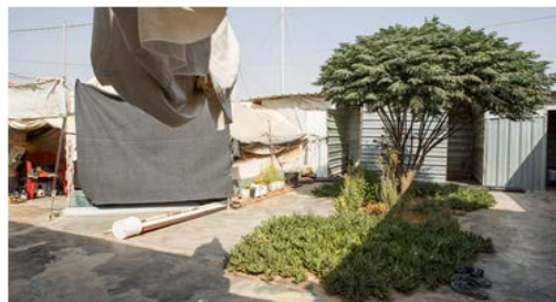
Zaatari refugee camp.

Partners are working on addressing both the short- and longer-term shelter needs for the most vulnerable refugees and also those from the host communities. Studies have shown that there is a continuing increase in vulnerability which has impacted the refugees' ability to cover their shelter needs, particularly those in urban, peri-urban and rural settings.