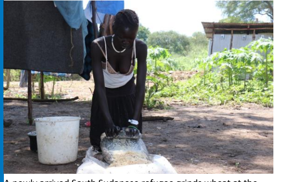
A newly arrived South Sudanese refugee grinds wheat at the Pagak Reception Centre to prepare food for her family.