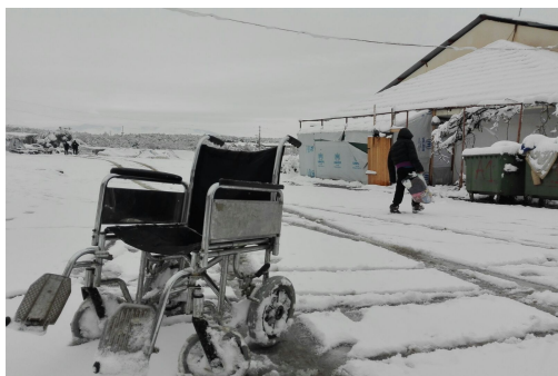
Snow covered Petra Olympiou site, just after the last group of asylum-seekers was transferred by UNHCR to more suitable accommodation in apartments and hotels