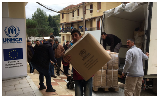
Mass winter non-food items distribution in all sites in Northern Greece © UNHCR / October 2016