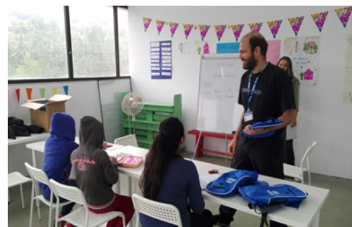
The first day of school for refugee children from Lagadikia and Derveni sites © UNHCR / October 2016