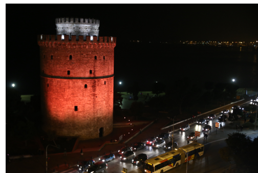
Thessaloniki sent a message against SGBV, by lighting its symbol, the White Tower, orange until midnight on 25 November. The initiative was promoted by UNHCR, and realized thanks to the Municipality and the Ministry of Culture. November 2016