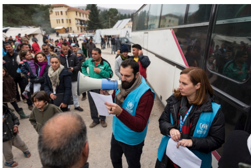
UNHCR staff organizing the transfer of over 1,100 Yazidi asylum-seekers from Petra Olympou site to appropriate accommodation facilities © UNHCR / C. Tolis, November 2016