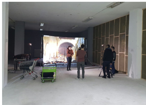
Refugee children participating in the photography/documentary seminar conducted at the Thessaloniki Film School, in collaboration with UNHCR