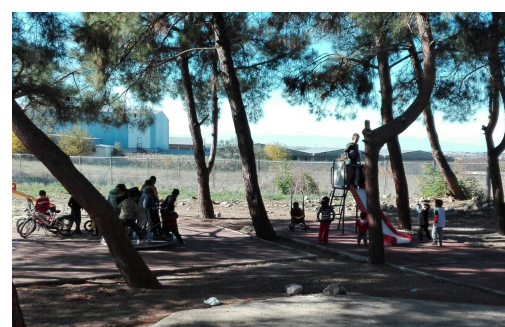
Refugee children enjoy the new playground constructed in Diavata site through one of the community-based interventions supported by UNHCR © UNHCR / November 2016