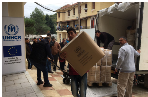
Mass winter non-food items distribution in all sites in Northern Greece © UNHCR / October 2016