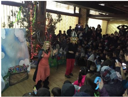
Children's party at Adasevci Transit Centre, (Serbia), 21 December 2016

Transit Centres (TCs) in the West sheltered 1,970 refugees and migrants: 1,025 in Adasevci, 624 in Sid and 321 in Principovac.