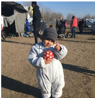
Refugee boy near Horgos, (Serbia) HCIT, 05 Dec 2016

Around 290 asylum seekers were counted in the North on 07 December: 68 in Subotica TC and 104 in Sombor TC, while the number of asylum-seekers camping in the open on Serbian soil close to the two Hungarian “transit zones” near Horgos I and Kelebija border-crossings dropped to below 100.