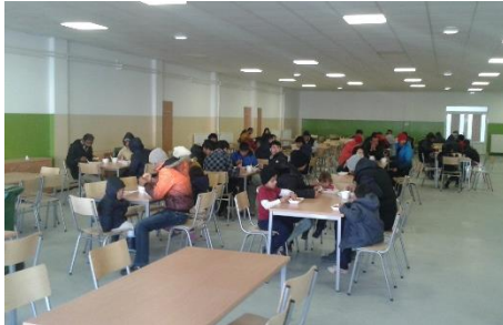
New dining hall in Presevo RC (Serbia) @UNHCR, 09 December 2016

Over 1,150 refugees, asylum-seekers and migrants were accommodated in two RCs: Presevo (939) and Bujanovac (215). Some 44% of residents of Presevo RC are from Afghanistan, 29% from Iraq, 13% from Pakistan, and 8% from Syria. Residents of Bujanovac RC, which accommodates only families and unaccompanied and separated children, are from Iraq (35%), Syria (29%) and Afghanistan (27%), with 9% others.