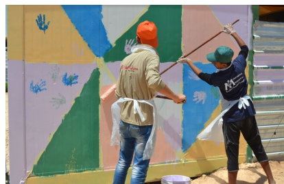
International Medical Corps and Mercy Corps volunteers and youths spent the day painting refugees' caravan to add a bit of colour and cheer.

UNHCR & IRD hosted a choral workshop and concert by Vox Humana, a renowned choir from Norway.