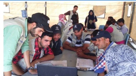
Cycle safety training