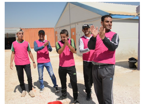
NRC students compete in a 'telematch' competition to mark International Youth Day.

Youth volunteers from various agencies, YTF members and colleagues from Protection, Age and Disability TF, Community Gatherings and Education sector attended the YTF held a mid-year review workshop on the 1 st of September at IRD center in D2. The workshop was held in Arabic, allowing for active participation by youth in the camp. Participants reviewed recent assessments and discussed recommendations in groups to prioritise actions to address the needs of youth in the camp. These were then added to the YTF Action Plan, which was reviewed and amended by the group.