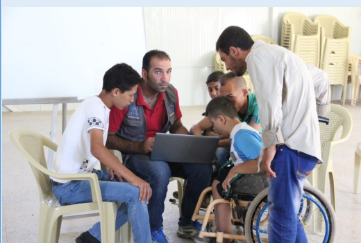
FPSC Inclusive Theatre Session

Numerous assessments have heard the voices of these youth calling for more recreational, educational, and occupational activities that meet their specific needs and enable participation with their peers. Sports facilities and trainers for persons with disability are missing in the camp, as well as games spaces that are accessible to young men with war injuries, notably in the newer districts.