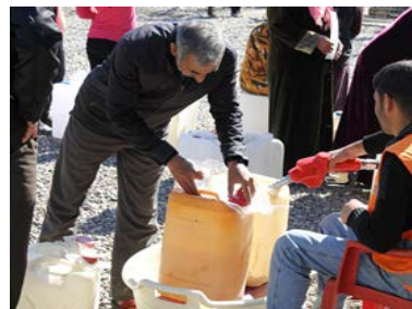
Kerosene distribution in Darashakran refugee camp, Erbil Governorate.

In Jordan, around 45,000 families have been reached with cash assistance this year, while some 52,000 families have been reached with in-kind basic needs assistance.