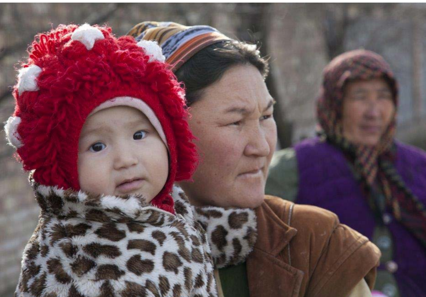
© UNHCR / A. Zhorobaev / December 2010

Registering births that occur in the territory is the duty of every State. It is vital that every child is registered at birth. However, given that birth registration does not always occur in a timely manner, States also need procedures for late and delayed birth registration and may consider undertaking campaigns to register older children and adults. Birth registration needs to be free, accessible and undertaken on a non-discriminatory basis.