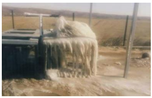
Frozen water blocks due to extreme cold in Nea Kavala © UNHCR / 9 January 2017