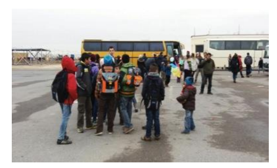
Second day of school for 150 refugee children from Nea Kayala site. Four schools receive the children: one in Polykastro, two in Axioupoli and one in Platania © UNHCR / 31 January 2017

Formal education. UNHCR continued to support the Education Program implemented by the Ministry of Education (MoE). As of the end of January, according to IOM, which is providing transport from sites to schools, 876 refugee children attend local schools from Lagadikia, Derveni Dion-ABETE, Sinatex/Kavalari, Nea Kavala, Kalochori/Iliadi, and Softex sites in northern Greece, and Konitsa, Doliana and Katsikas sites in western Greece (the latter are now accommodated in Ioannina hotels and the site is empty and being renovated). This includes 373 children going to primary schools, and 130 to secondary schools. In Nea Kavala, 99 children started to attend daily classes from 14:00 to 18:00 at three primary schools (two in Axioupoli and one in Polykastro), and 33 children the secondary school in Platania. Similarly, 35 children from Kalochori/Iliadi started to attend classes at the primary school of Kalochori and secondary school of Kordelio, and 44 children from Softex started to attend primary and secondary school in the Municipality of Chalkidona. At the same time, preparations for the implementation of the formal education program progressed at Alexandria, where