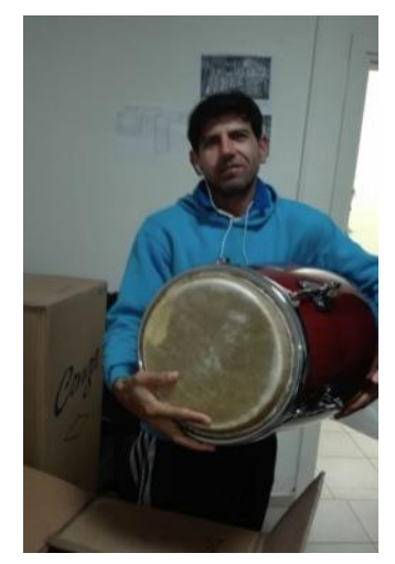
An Afghan asylum-seeker musician shows happiness when receiving drums and other musical instruments from UNHCR, as part of a communitybased intervention in Diavata site © UNHCR / January 2017

cash appear. This coordination exercise is essential, as different distribution systems (POS, vouchers, cash) still co-exist in the field. Ad hoc messages have been shared with UNHCR staff, site managers and NGOs in order to avoid people being registered twice for cash based assistance. By the end of the month, UNHCR team completed the verification exercise of all asylum-seekers residing in flats, hotels and apartment buildings under UNHCR's scheme in northern Greece, in preparation of the urban cash programme launch. A total of 3,210 persons have been registered, and vulnerabilities were recorded thoroughly during the process. The exercise confirmed that the percentage of vulnerable and extremely vulnerable individuals among the persons of concern in flats, hotels and apartment buildings is extremely high: 70 per cent are considered to be vulnerable in terms of medical, social, protection-related vulnerabilities. The high percentage did not come unexpected as vulnerable persons are prioritized in the allocation of out-of-camp accommodation. The verification exercise in western Greece will be completed in early February 2017.