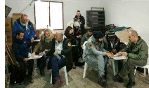
Authorities and partners attend a Site Management Support training provided by UNHCR at Alexandria site

As part of a comprehensive capacity building package for authorities and partners in northern Greece, UNHCR's Site Management Support Capacity Building Officer conducted on the job training session in Alexandria, on 17 January. Representatives of the Army, as well as humanitarian actors working at the site, such as IRC, participated. This training gathered nine participants from the Army and the Ministry of Migration Policy, as well as NGO partners. The main objective of the training was to build technical capacity regarding Site Management Support by learning site management holistic approach in order to improve site coordination.