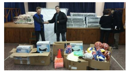
UNHCR donates IT equipment and sports educational material to schools in Thessaloniki, Lagadikia and Profitis

that are attended by refugee children. During their discussions with the Head of UNHCR Office in Thessaloniki, the Principals of Primary and High Schools of Lagadikia, Profitis and 67th Primary School of Thessaloniki expressed both their gratitude to UNHCR for the donations of information technology and sports equipment, as well as their strong will to continue the successful cooperation. In western Greece, UNHCR donated 30 schoolbags and 30 school kits to 30 refugee children attending secondary schools in Ioannina and residing in Exohi and Egnatia hotels.