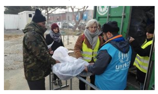
UNHCR distributing at thermal blankets in preparation of the cold wave at Diavata site © UNHCR / 5 January 2017

persons are accommodated in these prefab houses. In response to the cold wave registered in early January, UNHCR conducted infrastructure interventions in several sites in northern Greece. In Nea Kavala, in collaboration with its partner Samaritan's Purse, UNHCR provided tarps to avoid ice and snow infiltrations in some prefab houses. In Vasilika, before the evacuation of the site, UNHCR completed the permanent fencing and installed 27 UNHCR family tents equipped with wooden floor plus 13 extra floors. Electrical cabling and generators were also installed by UNHCR, through its partner Danish Refugee Council (DRC) in Lagadikia, Alexandria and Nea Kavala, and its partner Arbeiter-Samariten-Bund Deutschland (ASB) in Vasilika. Two extra generators were provided by UNHCR in