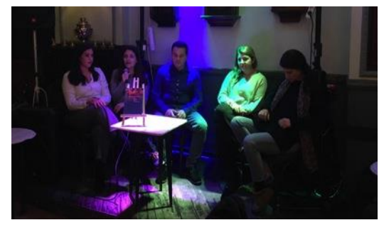
Thessaloniki public was moved by the testimonies of unaccompanied children in Greece collected by the Hellenic Theatre/Drama & Education Network and UNHCR in the book "Monologues across the Aegean Sea"

• On 29 January, with the support of UNHCR, a judo athlete who is hosted in the area of Ioannina, Epirus region, participated in an international judo tournament which took place in Thessaloniki and won the bronze medal. On the same day, UNHCR alongside with members of the Hellenic Theatre/Drama & Education Network presented the special-edition book "Monologues across the Aegean Sea: the journey and dreams of unaccompanied refugee children", at an event organized in Prigkipos Café, Thessaloniki. The book, published in Greek and in English in October 2016 by the Hellenic Theatre/Drama & Education Network and UNHCR, is a collection of 28 testimonies of unaccompanied refugee children from Syria, Afghanistan, Pakistan, Iran, Morocco and Egypt, who were forced to leave their homeland and arrived alone in Greece, crossing the Aegean Sea.