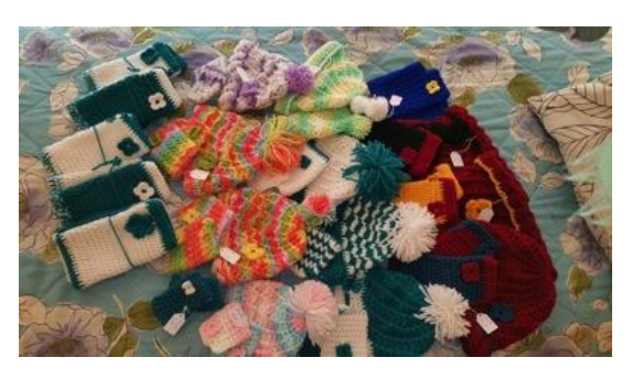
The colorful results of a knitting community-based project realized by asylum-seekers hosted under UNHCR's accommodation scheme in Thessaloniki

performance was greatly appreciated by the refugees. In cooperation with the NGO Perichorisis, UNHCR initiated community engagement activities in two hotels in the area of Katerini. Skilled female community members will run knitting classes for their peers aiming at strengthening the protection network. Additionally, UNHCR's partner will be arranging a weekly community meeting with a specific age group to discuss about particular topics proposed by the refugees. In four hotels in Grevena and one in Kastoria, all under UNHCR's accommodation scheme, UNHCR is implementing several activities through its partner Praksis, which are highly appreciated by the community: English classes for both adults and children; handicraft workshop (paper modelling and origami) conducted by a male refugee for children and youth; "women's night" dedicated to activities such as hairdressing, makeup and waxing; sportive activities, including football, tennis and basketball; provision and distribution of various board games for adults like chess, backgammon, jenga, etc.