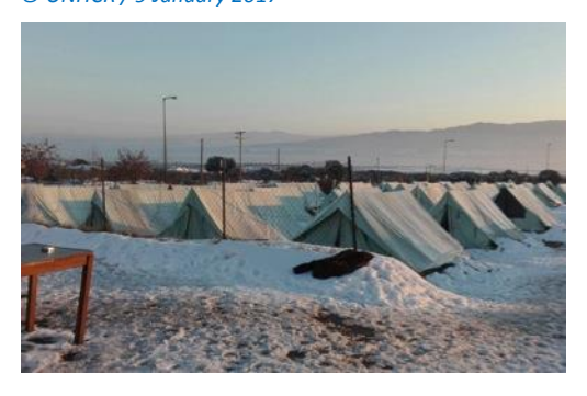
Empty tents in Vagiochori, after a UNHCR evacuation to improved shelter © UNHCR / 12 January 2017