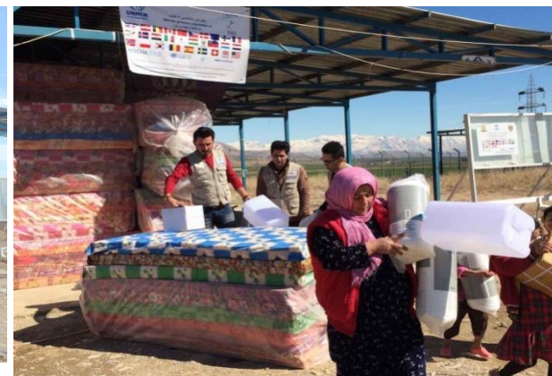
Non-food item distribution in Sulaymaniah governorate. 2017.