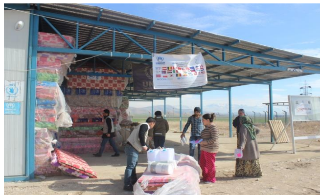
Non-food item distribution in Sulaymaniah governorate. 2017.

During post-distribution monitoring, a woman said, "Kerosene saved our lives [this winter]." Many families burned the kerosene throughout the night, and clinics did not observe any rise in cold-related illnesses.