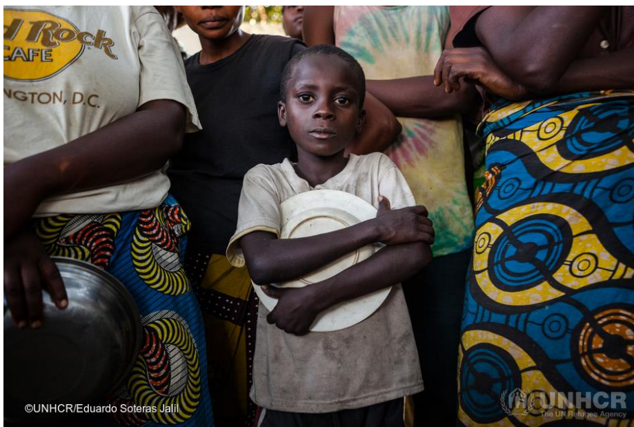
Burundian refugees wait at the meal tent at Kamvivira transit centre