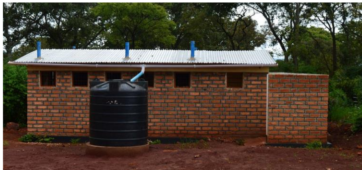
Newly constructed school latrines in Mtendeli Camp.