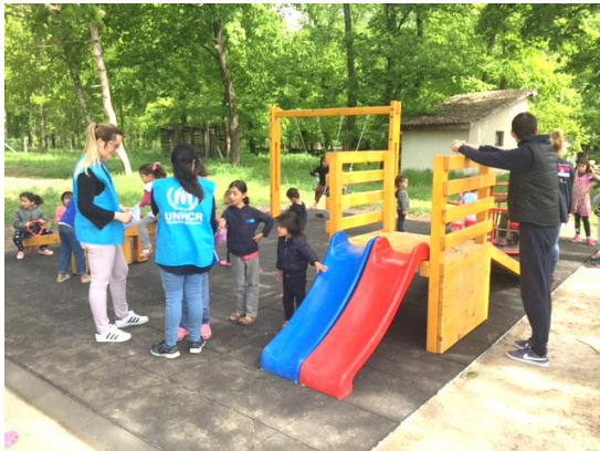
Children in Sombor Transit Centre playground, Sombor (Serbia), ©UNHCR, 26 April 2017

Transit Centres in the West sheltered 1,461 refugees and migrants: 830 in Adasevci, 320 in Sid and 301 in Principovac.