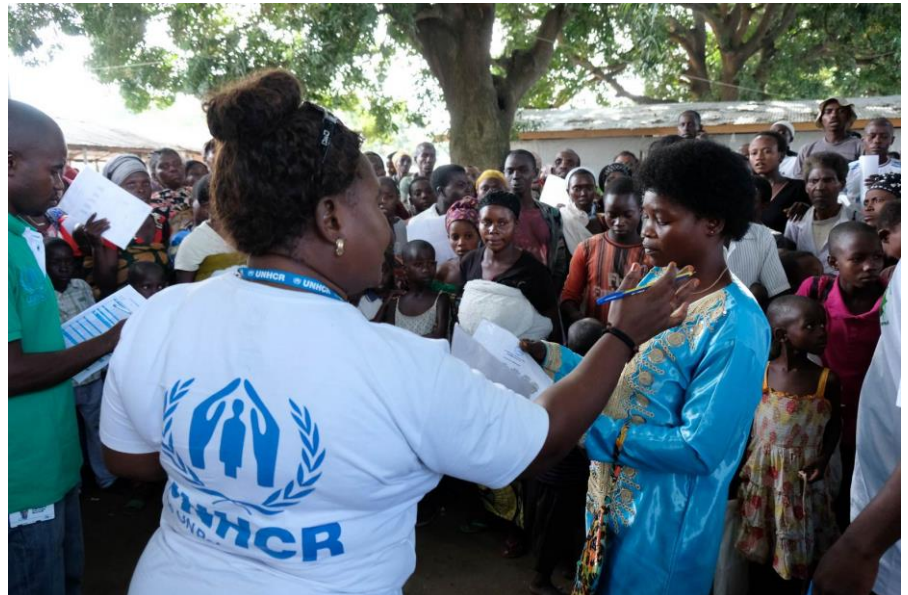
A UNHCR staff member addresses refugees in the overcrowded Kavimvira transit center.