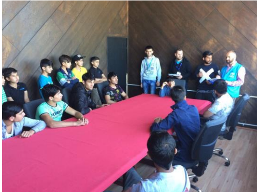
Focus group discussion with refugee boys in Presevo RC, Presevo (Serbia) UNHCR, 18 May 2017

499 refugees and migrant were accommodated in four Reception Centres: 209 in Pirot, 188 in Divljana, 61 in Dimitrovgrad and 41 in Bosilegrad. Most are from Iraq and Afghanistan, followed by Syria, while around half are children.