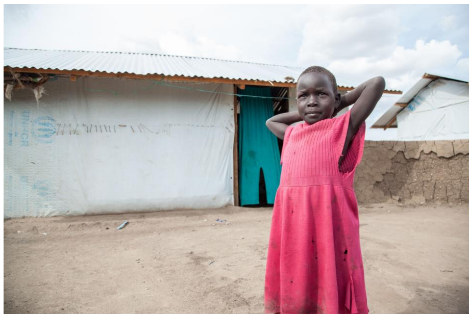
A South Sudanese new arrival girl stands outside their her home in Kalobeyei Settlement.