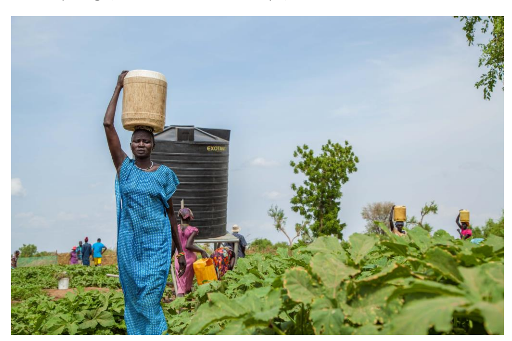
A South Sudanese woman carries water for irrigating her piece of land at the 3 acre agricultural land in Kakuma refugee camp.

A total of 884Kgs of vegetables were harvested at the 3 acre agricultural land in Kakuma refugee camp, out of this 802kgs were sold for KSh. 59,410.00 and 82Kgs worth KSh. 11,020 were consumed by the farmers. The 3 acre farm provides a livelihood opportunity for both refugee and host communities as well as a source of food.