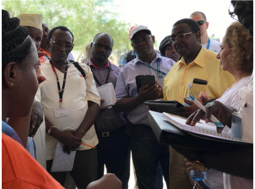
Photo: Technical review team during a field visit to Kakuma refugee camp