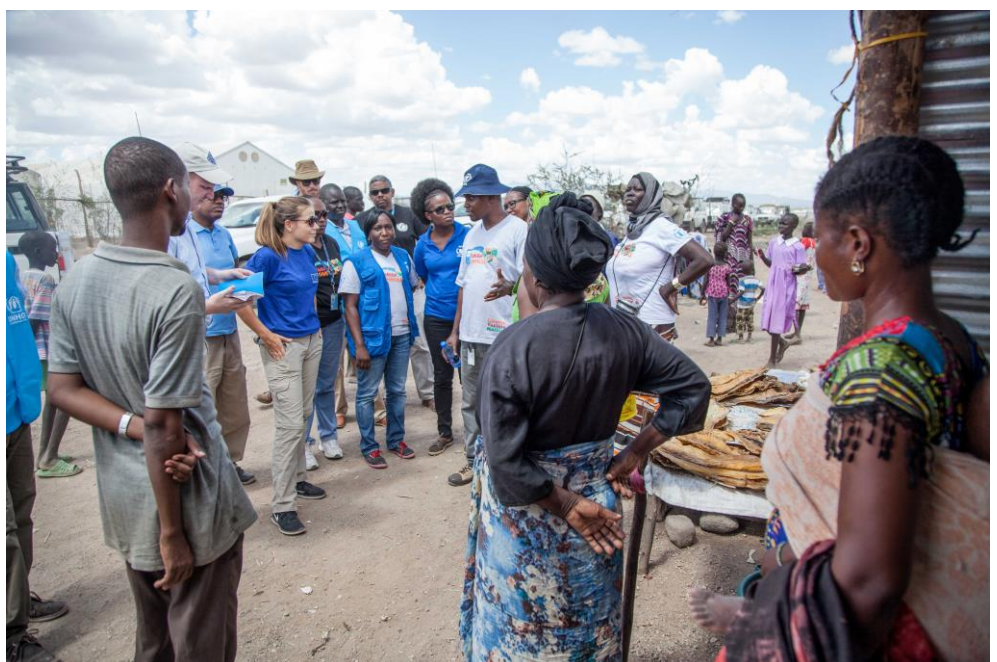
Photo: EUTF mission interacting with vegetable traders at Kakuma 4 market