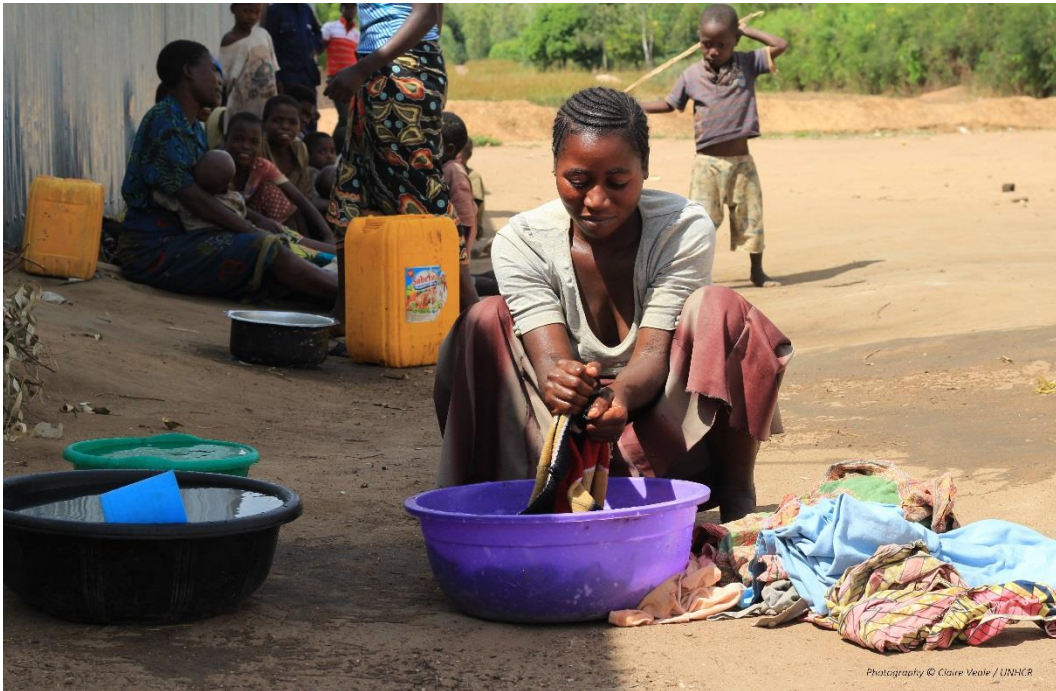
A woman washes her family's clothes outside the gathering point of Sange. She has been waiting for a place inside the centre for over 3 months.