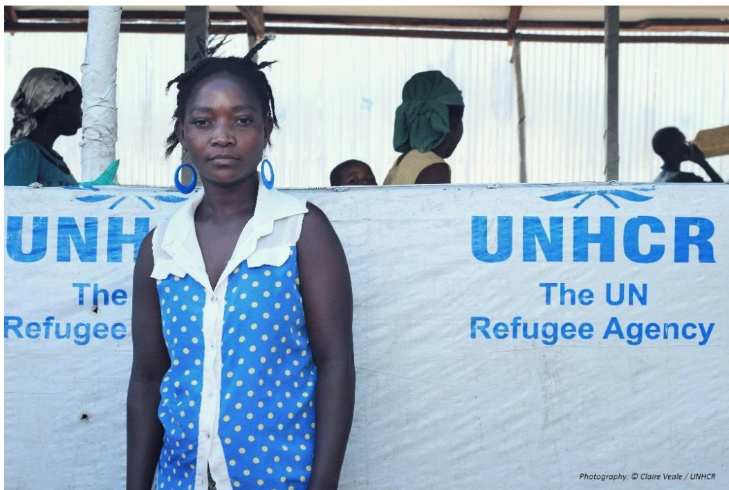
A young woman waits, along with over 1,000 other Burundian refugees, outside the UNHCR host structures for as place inside the transit centres, with little access to food, shelter and medical assistance.