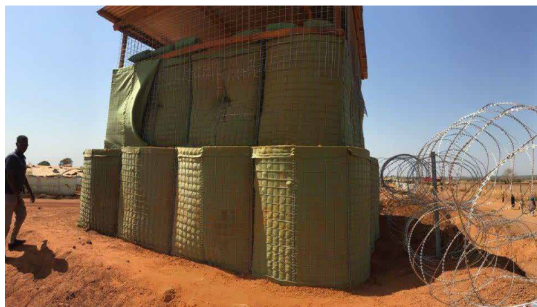
Wau PoC: NEPBATT guard post and concertina wire installed by camp management to enhance security around the PoC