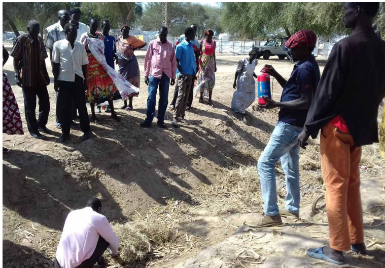
Bor PoC fire prevention training: Practice demonstration on how to extinguish a fire