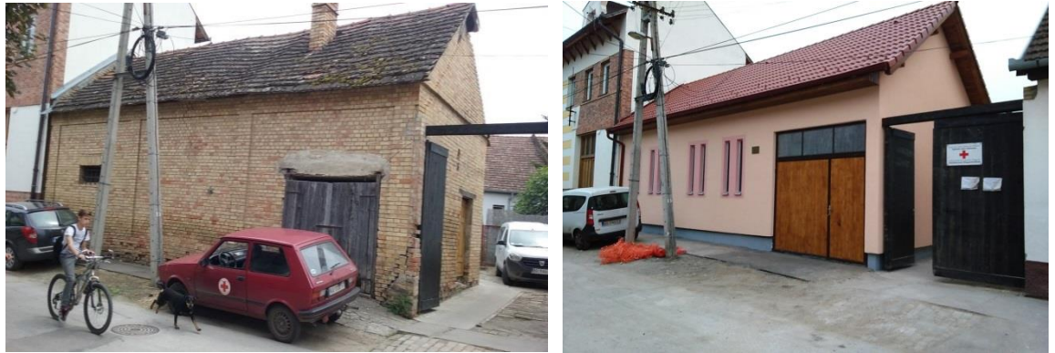
BEFORE and AFTER: Reconstructed Red Cross Kanjiža building and entrance, following the UNDP intervention, Kanjiža (Serbia), @UNDP, 23 May 2017

youth, refugees/migrants from Preševo RC