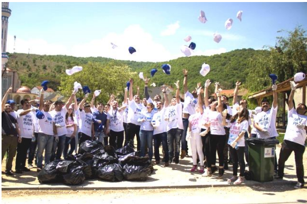
Local youth, refugees/migrants, UNDP volunteers and Government of Serbia representatives celebrate the success of a joint volunteering action, Miratovac (Serbia), @UNDP, 4 May

Affairs and refugees/migrants/asylum-seekers from Preševo RC, jointly organized a voluntary activity of waste cleaning in the village of Miratovac in the municipality of Preševo. Over 50 volunteers and occupants of Preševo RC participated in this activity, collecting waste throughout the village of Miratovac. This event was jointly organized by Divac Foundation and UNDP, through projects funded by USAID.