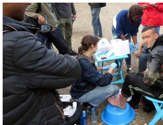
MDM staff providing medical assistance in transit centre Šid (Serbia), ©UNHCR, 5 May 2017

Health of Serbia, visited the transit centre in Obrenovac in order to assess the health situation and the availability of services. Although Obrenovac TC is overcrowded, with almost 1,400 persons accommodated, the sanitary conditions in the centre was assessed to be acceptable and access to health care services was on a high level, with three medical teams present in the centre daily.