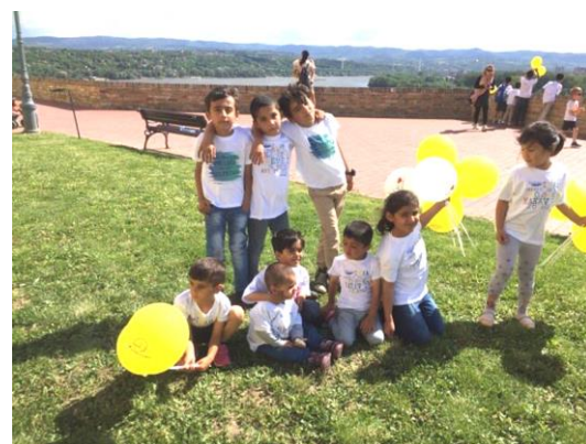
Refugee children from Krnjača Asylum Centre participated in Baby Exit Festival, Novi Sad (Serbia), 27 May 2017