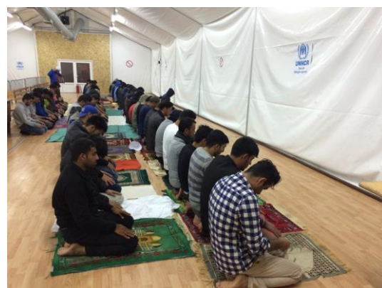
Ramadan prayers in Preševo Reception Centre (Serbia), @UNHCR, 28 May 2017