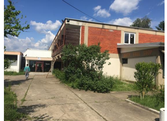
Newly opened Reception Centre in Vranje (Serbia), @UNHCR, 28 May 2017