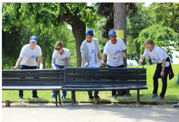
Volunteers from Belgrade and refugees/migrants work side by side to make Kalemegdan park more beautiful, Belgrade (Serbia), @UNDP, 24 May 2017