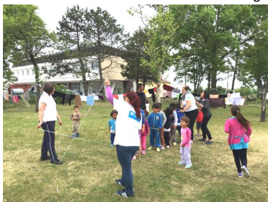
SOS CV organised activities for children in the Transit Centre in Kikinda (Serbia), ©UNHCR, 08 May 2017