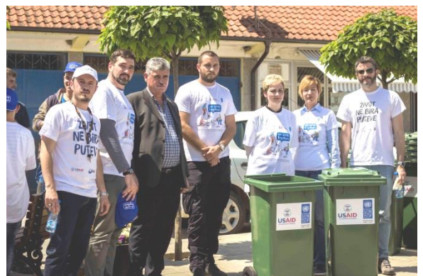
MPALGS, SCRM, Preševo municipality, UNDP and the Divac Foundation officials participate in the hand-over of waste management equipment, @UNDP, 4 May 2017