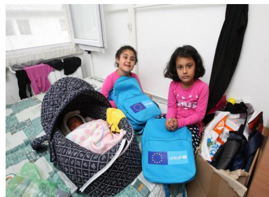
UNICEF, thanks to ECHO funds and in cooperation with SCRMM, provided backpacks and school materials to school-age refugee/migrant children in Krnjača AC, ©UNICEF Serbia/2017/Emil Vas