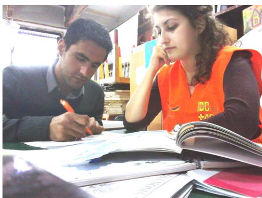
IDC organised integration workshops in Serbian language in Miksalište, Belgrade (Serbia), ©IDC, May 2017