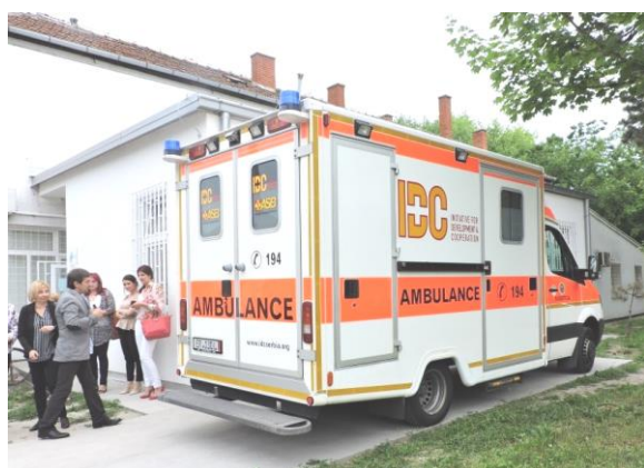
ASB/IDC donation of ambulance vehicle to Subotica Health Centre (Serbia), May 2017